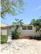
415 NE 3rd St

MLS#: F10087036 Status: CS Price: $215,000 SqFt: Beds: 2 Bath: 2 (2 0)