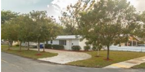
519 NE 10th Ave

MLS#: A10285059 Status: CS Price: $216,000 SqFt: 1,392 Beds: 3 Bath: 1 (1 0)